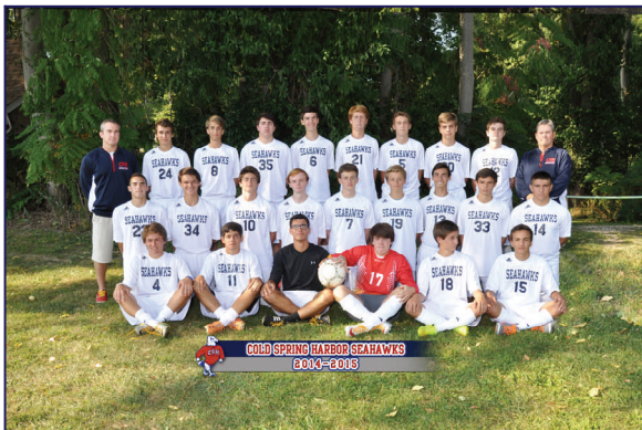
Boys Varsity Soccer - #1 New York State Scholar-Athlete Team Overall Team GPA 97.25